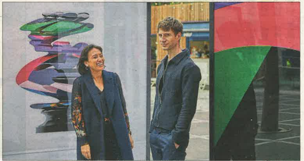
Follow the trail across the Square Mile: collaborative work by sculptor Nick Hornby and painter Sinta Tantra takes in Finsbury Avenue Square, right