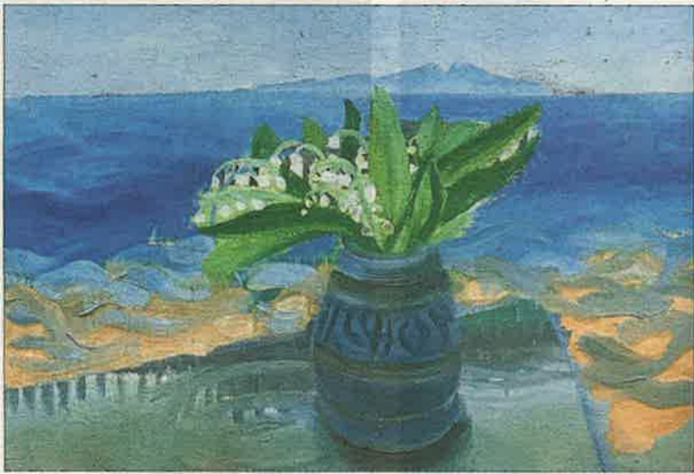
Tribute to English painting: Lily of the Valley, St Bees (1940) by Winifred Nicholson, at Crane Kalman gallery in SW3