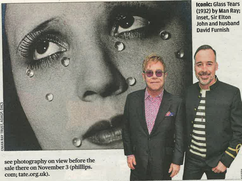
Iconic: Glass Tears (1932) by Man Ray; inset, Sir Elton John and husband David Furnish

SIR Elton John has created one of the world's finest photography collections over the past 25 years, amassing more than 7,000 prints taken between the Twenties and the Fifties. Now 150 are on loan to Tate Modern and will be on view there from November 10 to May 7. Images from Man Ray, Brassai and Penn will showcase a golden age in photography. Look out also for the work of Edward Weston and Kertész, as well as portraits of Matisse and Picasso. It's bound to be one of the exhibitions of the year. The singer "hopes that the exhibition audience experiences as much joy in seeing the works as I have had in finding them". If this inspires you to start a collection of your own, visit Phillips auction house in Berkeley Square to