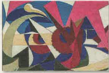
Dynamic: Lines of Force of Landscape Majolica (1917-18) by Giacomo Balla, a founder of art's Futurist movement