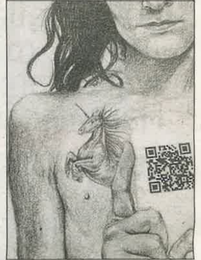
Scan the code: each Phoebe Boswell model has a message for the viewer

■ For Every Real Word Spoken, by Phoebe Boswell, until April 22 at Tiwani Contemporary, Little Portland Street, W1 (tiwani.co.uk; 020 7631 3808)