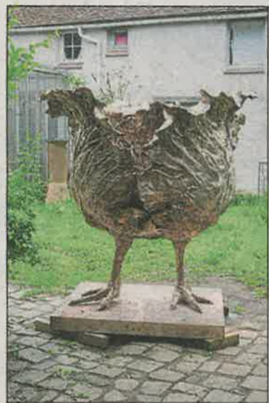
Veg out: see Claude Lalanne's bronze Le Chou de Milan (2016) in Regent's Park

Conrad Shawcross. Don't miss Claude Lalanne's enchanting cabbage on legs. The French artist, 90, is also known for her highly wearable jewellery, available through Louisa Guinness Gallery ( louisaguinnessgallery.com ).