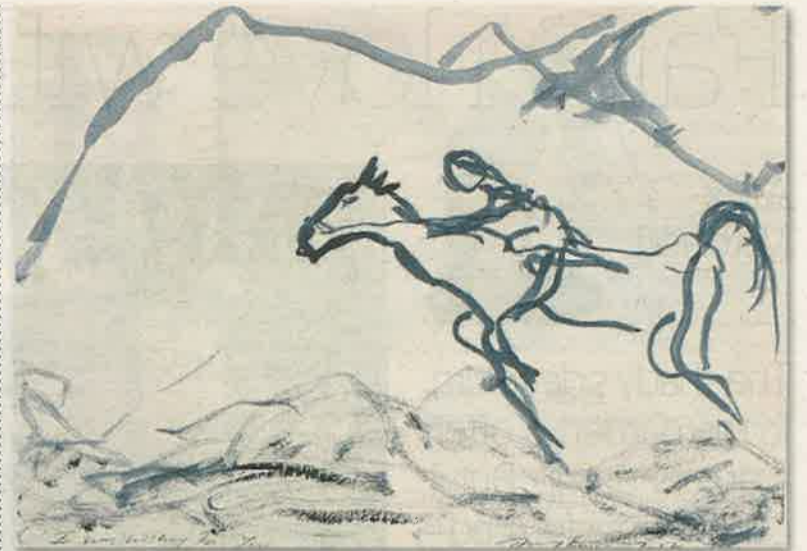
If wishes were horses: Tracey Emin's drawing inspired by a girl's holiday request