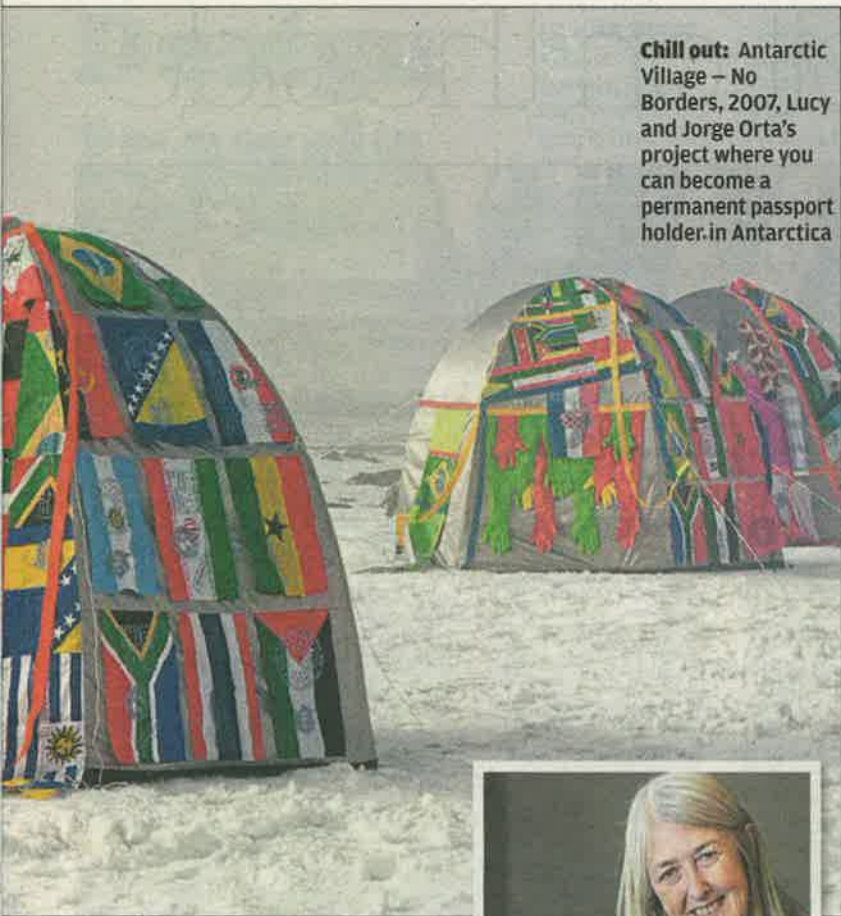
Chill out: Antarctic Village – No Borders, 2007, Lucy and Jorge Orta's project where you can become a permanent passport holder in Antarctica